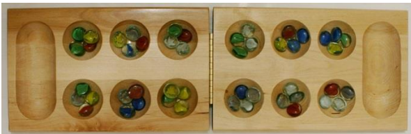
Figure 2: Modern Mancala board

Hybrid classrooms and purely brick and mortar educational delivery models can both leverage the concept of gamification to enhance engagement and improve content comprehension. While contemporary views of gaming are focused on digital video games, the [non-digital] game of Mancala was spread in part through the movements of the soldiers of the Roman Empire. Many Roman period Mancala boards are graffiti type boards, that is to say the rows of cup indentations were carved into the steps of the theatre at Palmyra; others are found in house floors and temple walls as documented in a recent survey. Others have been found in Ephesos and northern Egypt; largely adhering to the boundaries of the Roman Empire. (Hirst, 2013) Enterprising legionnaires could have leveraged the stone and pit based game into a training exercise had that idea been more in keeping with the zeitgeist.