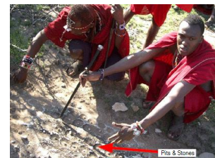
Figure 3: Original Pit & Stone Mancala

At the most basic level, there is particular skill content which lends themselves to specific types of games. As with the application of gamification itself, care must be used when borrowing an idea from one field and adapting it to another. Early learning games simply showed the student